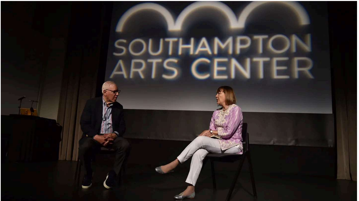
David Rubenstein and Judith Miller spoke at the screening for 'Once Upon a Time in Ukraine' at Southampton Arts Center.

On the weekend before the Democratic National Convention — in the midst of a high-temperature season of presidential fundraisers — Hamptons heavyweights with serious political bona fides gathered at a series of events on the tony East End, along with folks from the entertainment world.